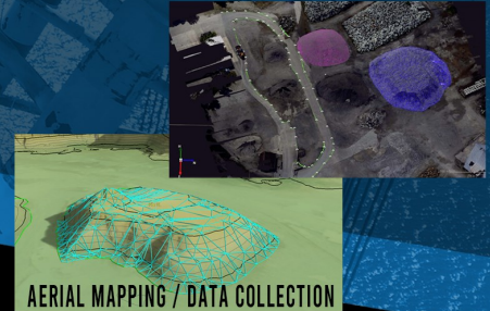
AERIAL MAPPING / DATA COLLECTION